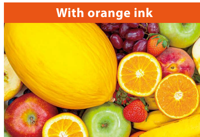
Clearer more vivid colours