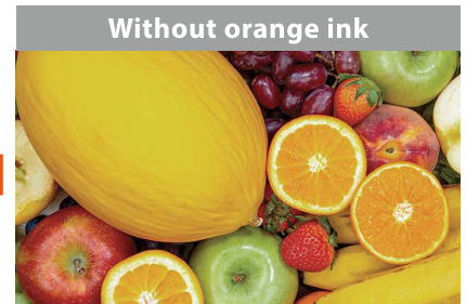
*Images are for illustrative purposes only. They may differ from actual printed materials.